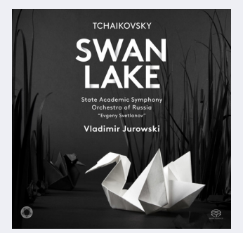
PTC 5186 640