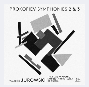
PTC 5186 624