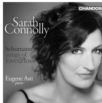
Schumann Songs of Love and Loss CHAN 10492