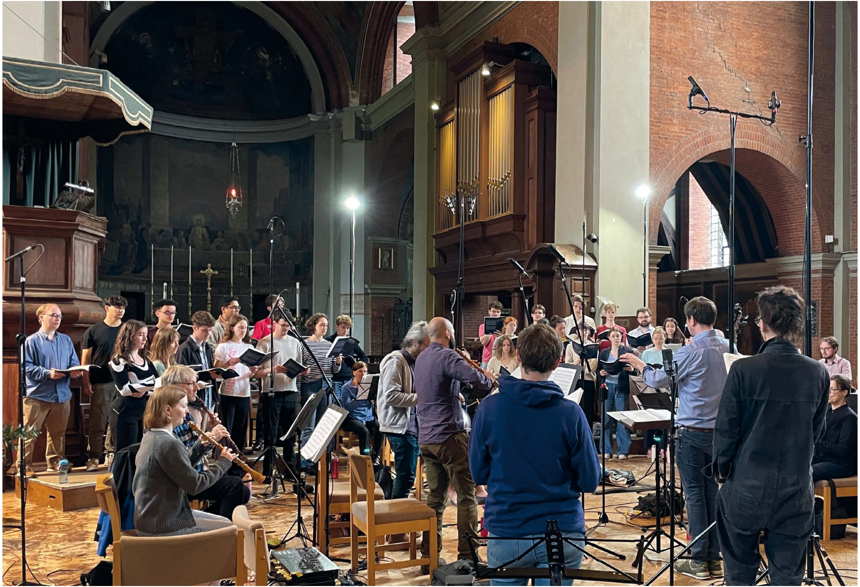
The choir and players recording the Missa Sancti Hieronymi .