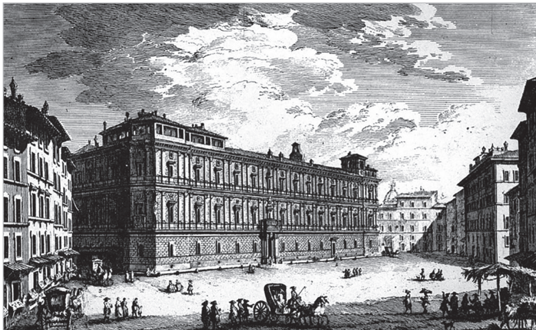
The Palazzo dell Cancelleria in Rome, by Giuseppe Vasi, 1754. This was a previous residence of Cardinal Pietro Ottoboni, one of the greatest patrons of the arts in eighteenth century Italy where he had constructed a theatre and held regular concerts where Handel, Corelli and other musicians met and performed music.

from the Medicis unless they just preferred the work of other artists. Finally another mystery shrouding this event is why Handel decided to leave Italy when he did, especially in view of his increasing popularity, financial support, and his immersion in a wealth of inspirational decadent music and art in Italy.