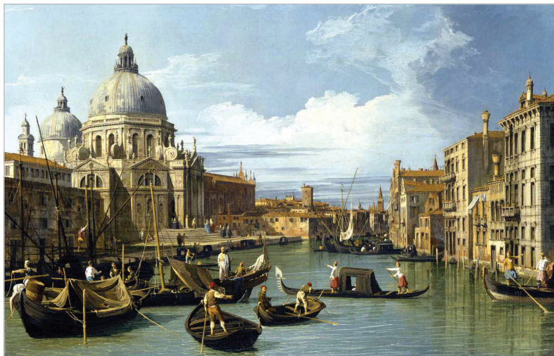
Canaletto, Venice 1709.

librettists. Nisi Dominus is based on Roman ideals and is baroque in form and idiom. It has a sequence of coups-de-theatre and poetical lines of text and word painting. In Sicut Sagittae , arrows are depicted by scalic flourishes with the strong bass voice depicting the mighty one, 'As arrows in the hands of the mighty: thus are the children of outcasts'.