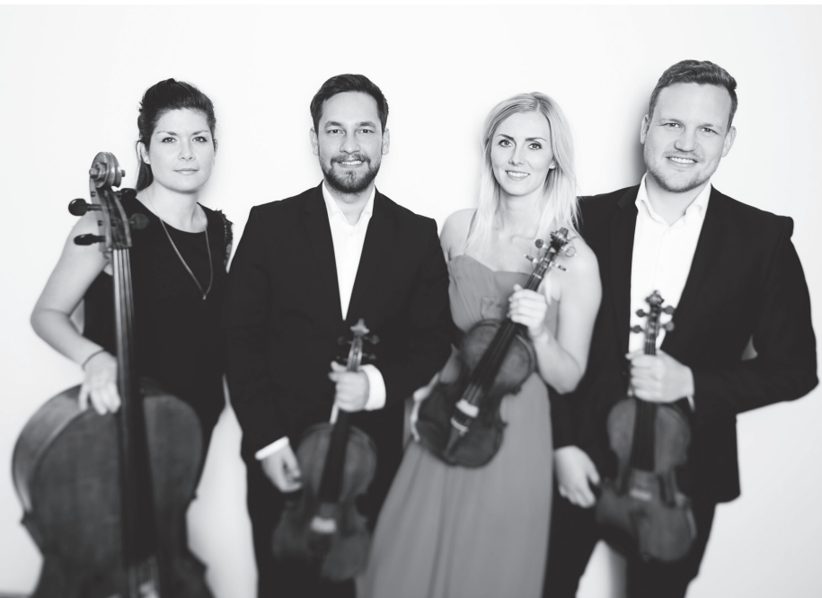
Nordic String Quartet