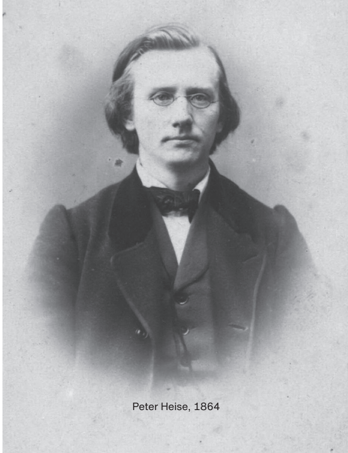
Peter Heise, 1864

His hundreds of songs and romances were very popular and beginning to be printed in large numbers, spreading his music to the many Danish homes equipped with a piano. He was seen, to a high degree, as a vocal composer.