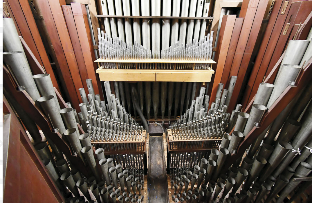
Pipes of the Grand-Orgue following the restoration of the organ in 2018