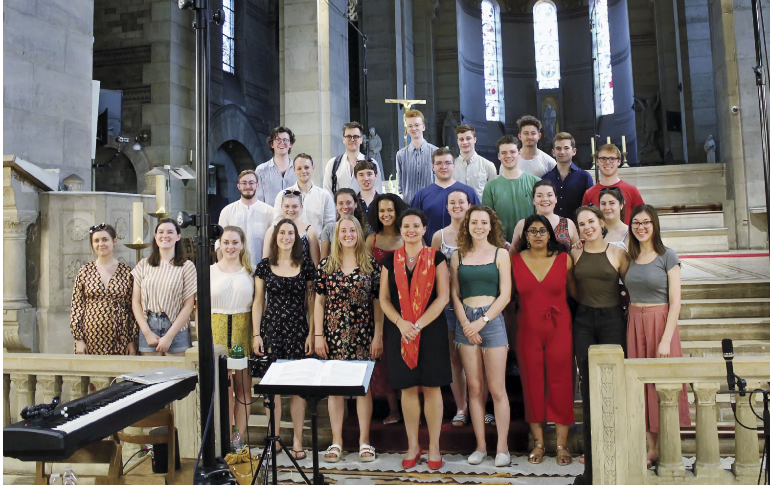
The Choir of Royal Holloway with alumna, Sarah Fox, during a recording session