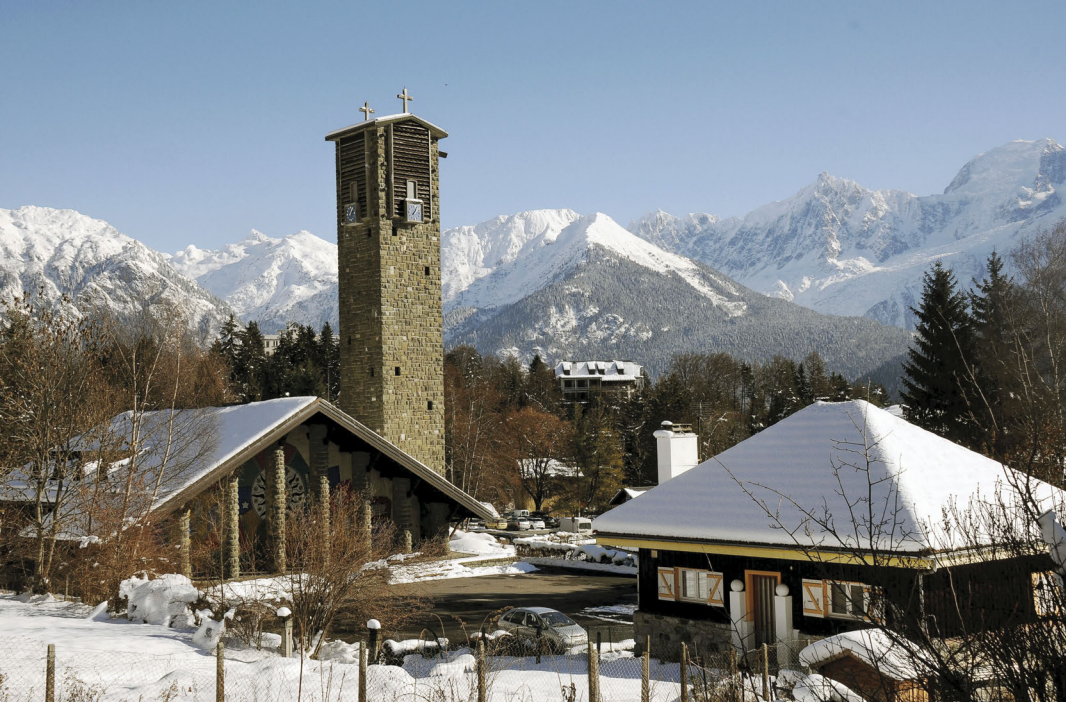
The church of Notre-Dame de Toute Grâce, Plateau d'Assy

opulent and richly scored, and it is hardly surprising then that later versions exist with string or full orchestral accompaniment. The piece is often performed by upper-voice choirs but this is the first recording of the work with solo soprano – and with a French organ. Villette's setting of the Ave Maria is far removed from the pious offerings of Bruckner or Gounod, but here, in the vernacular, this devotional prayer feels more intimate. Human emotion abounds in the expressive solo lines and exotic harmonies of this romantic miniature.