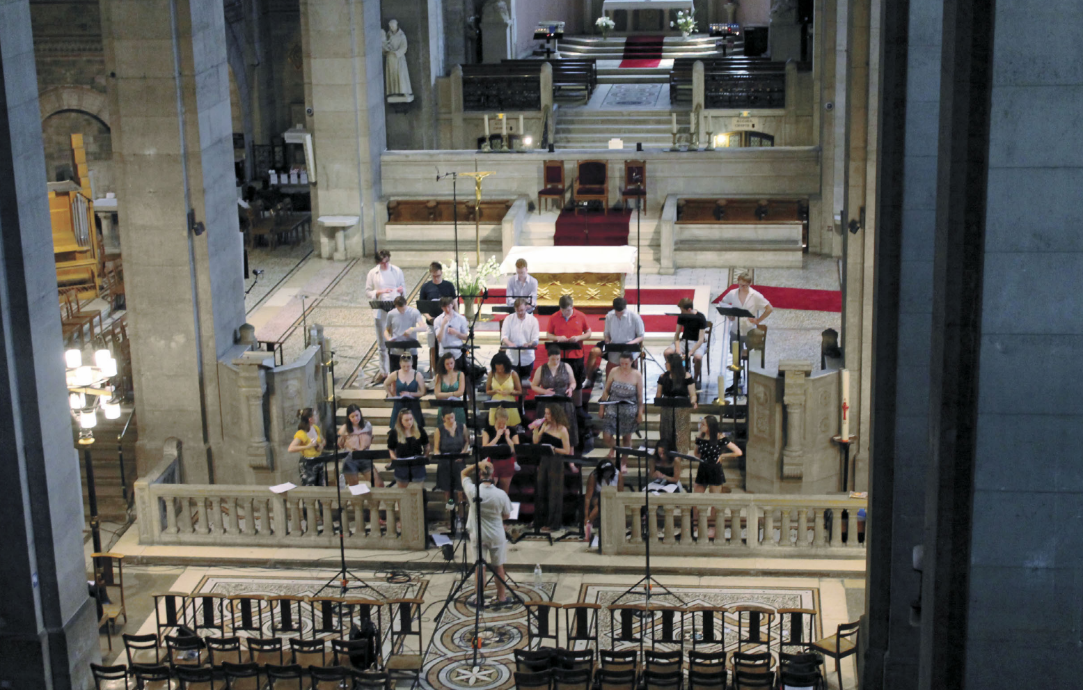
The Choir of Royal Holloway during a recording session