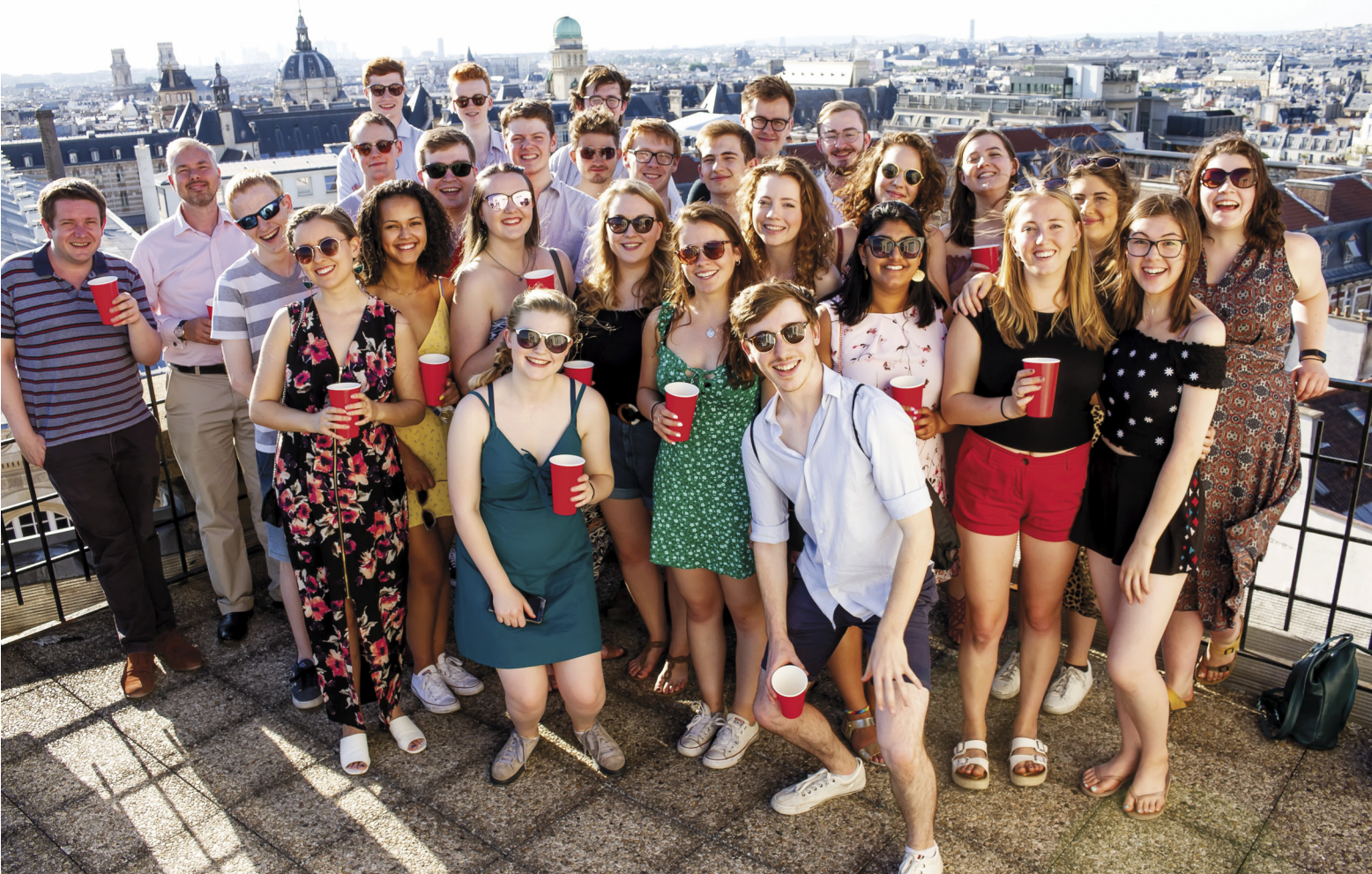
The Choir of Royal Holloway on the roof of the Duruflé apartment, following a recording session