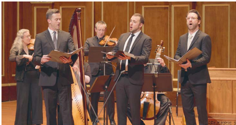
Photograph from the March 2024 performance of Marazzoli cantatas in New England Conservatory's Jordan Hall, featuring the Boston Early Music Festival Vocal and Chamber Ensembles