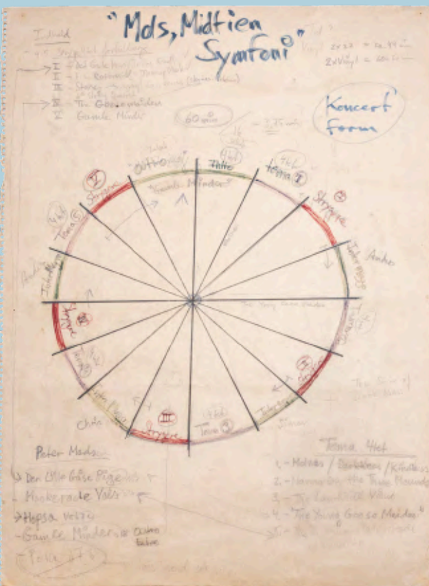
Buchanan's Sketches to the Music

Dragsmur ( The Wall of The Dragged Passage ) is the transition or passage from Mols that leads to Helgenæs, from where one can look back across to overview Mols.