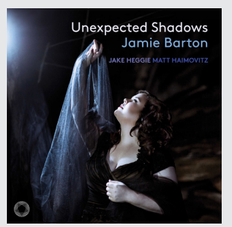
PTC 5186 836