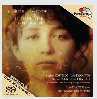
PTC 5186 515