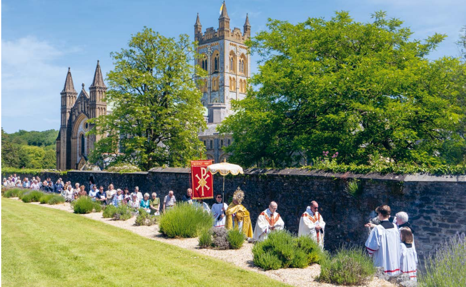
Procession of the Blessed Sacrament following Mass on the Solemnity of Corpus Christi