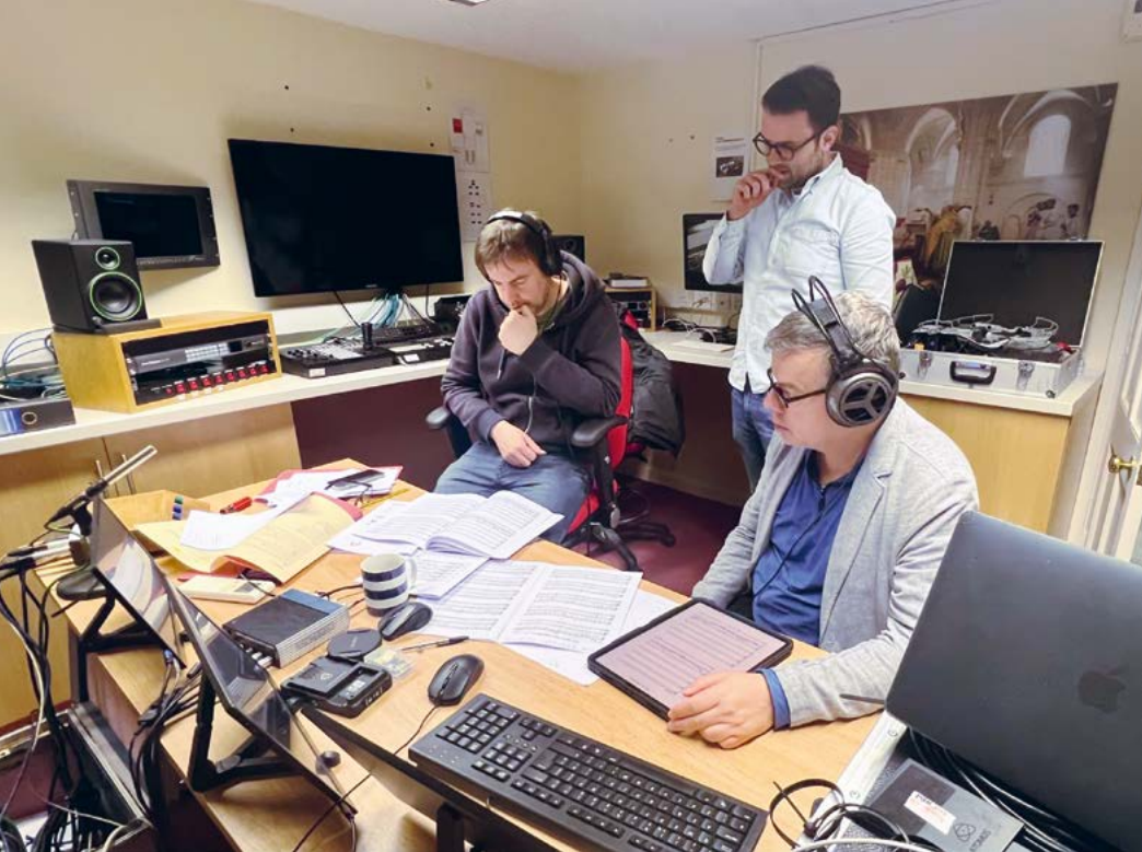
Listening back to takes in the control room between recording sessions