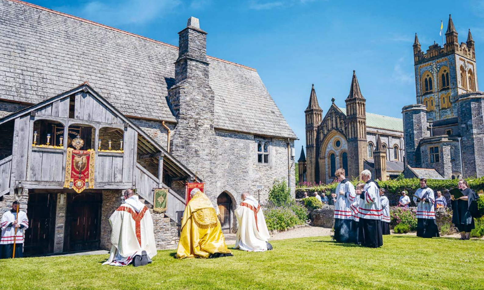
Benediction following Mass on the Solemnity of Corpus Christi