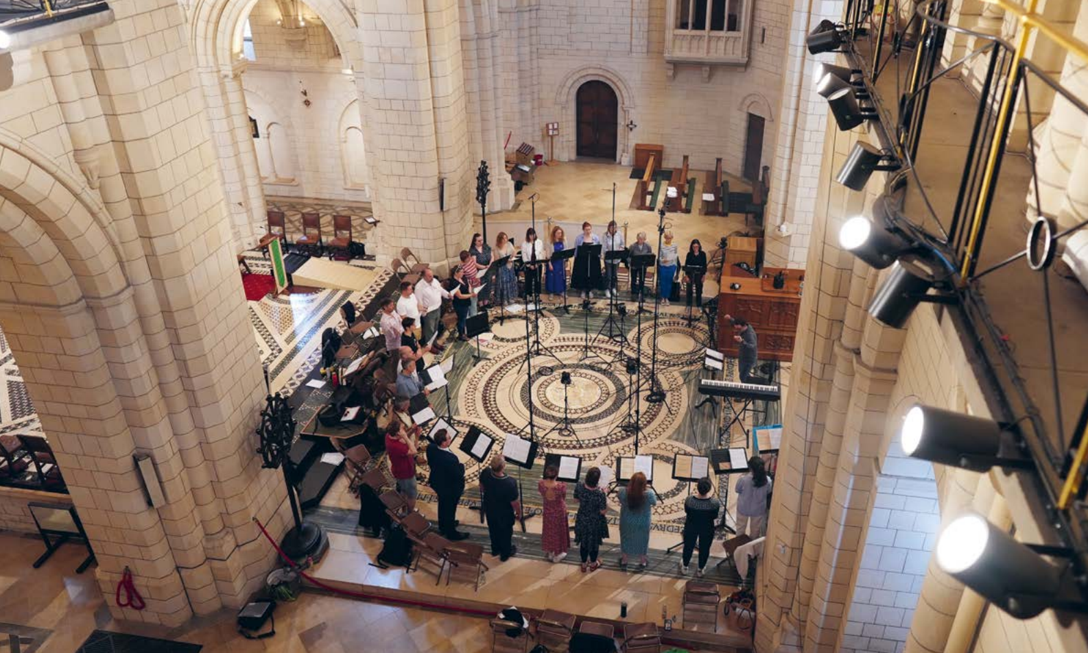
The Choir of Buckfast Abbey during a recording session