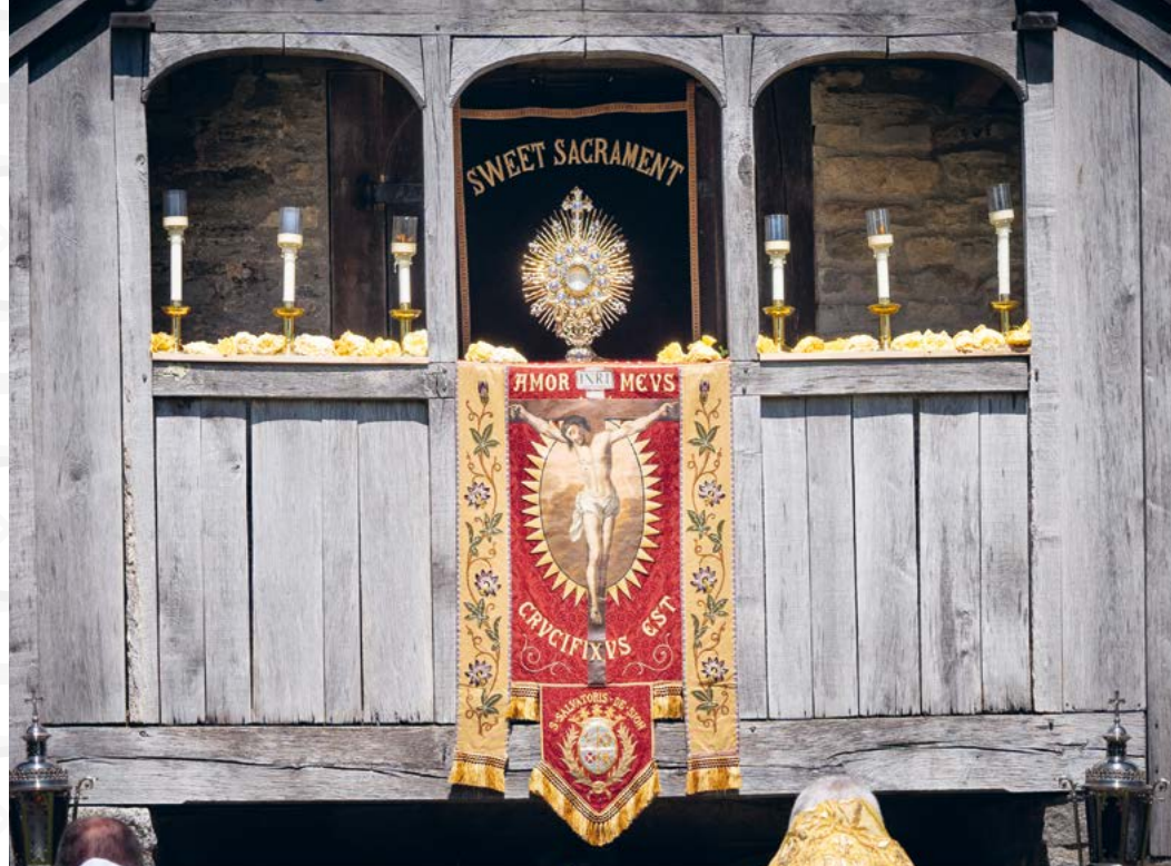
Benediction following Mass on the Solemnity of Corpus Christi