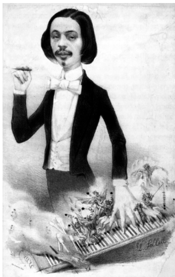
A cartoon of Fumagalli playing his Grande Fantaisie pour la main gauche sur 'Robert le diable' de Meyerbeer

Adolfo Fumagalli deserves a prominent place in the international musical panorama of the nineteenth century. His rapid career disproves the myth that Italian instrumental music found itself in a subordinate position by the middle of the century, but his stature was soon overlooked. His early death was one reason for his neglect. Another was the systematic effort at the end of the century to retrieve an authentically Italian style and re-establish those glorious Baroque and eighteenth-century traditions. And so Fumagalli's contemporaries and successors underestimated his importance and his outstanding music rapidly fell into oblivion – an omission this recording and its successors will seek to redress.