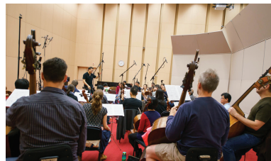
Hong Kong Philharmonic Orchestra, Bright Sheng