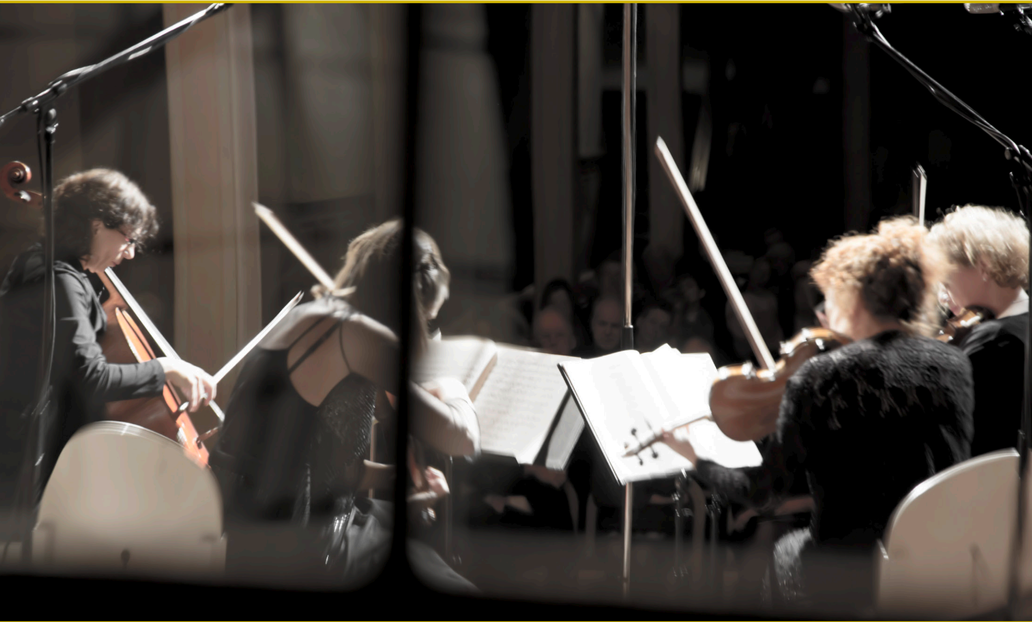
WOLFGANG AMADEUS MOZART ~ STRING QUARTET NO. 14 - SPRING QUARTET