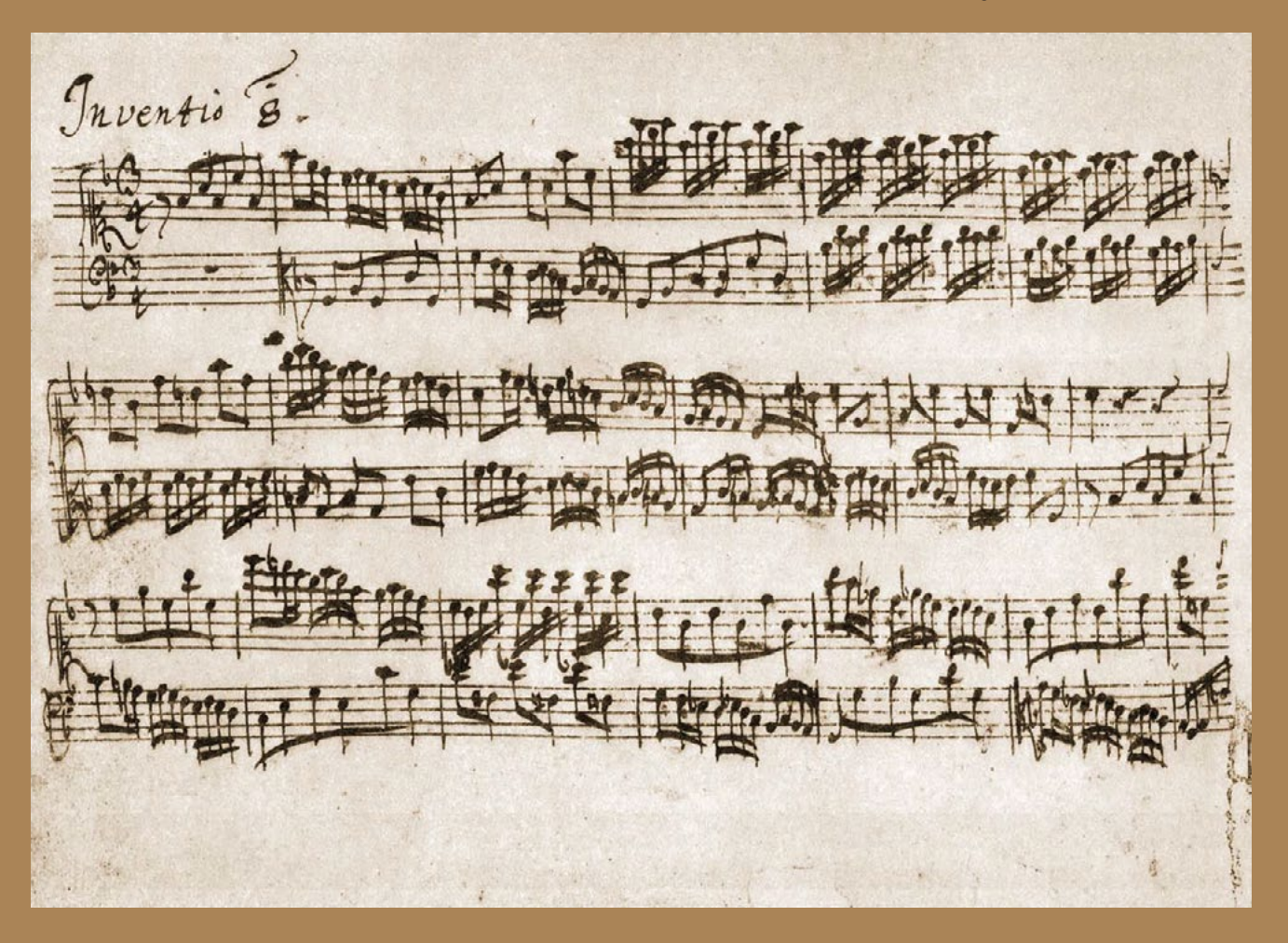
From Bach's manuscript for the Invention No. 8 in F Major