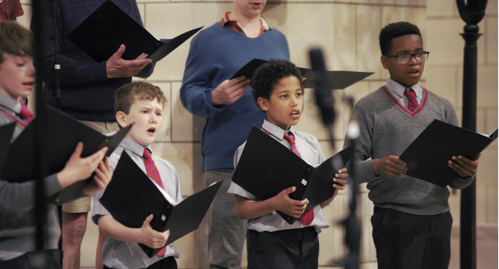
The Choir of Westminster Cathedral during a recording session at Buckfast Abbey