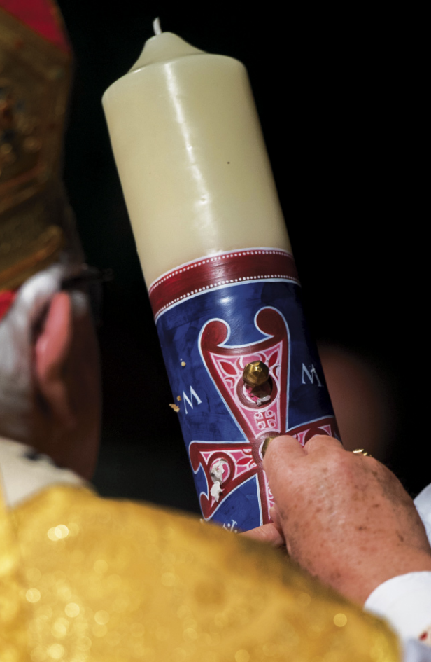
Cardinal Vincent Nichols inserts the grains of incense into the paschal candle