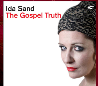
The Gospel Truth