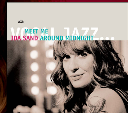
Meet Me Around Midnight ACT 9716-2