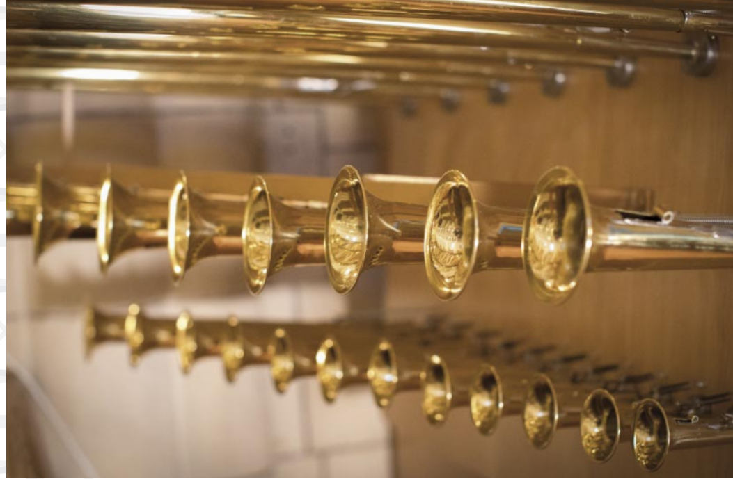
Brass pipes of the Pontifical Trumpet