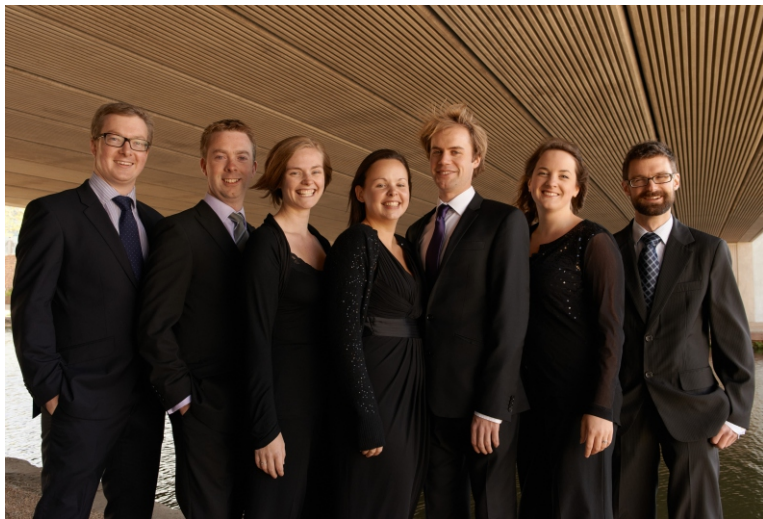
Berkeley Ensemble