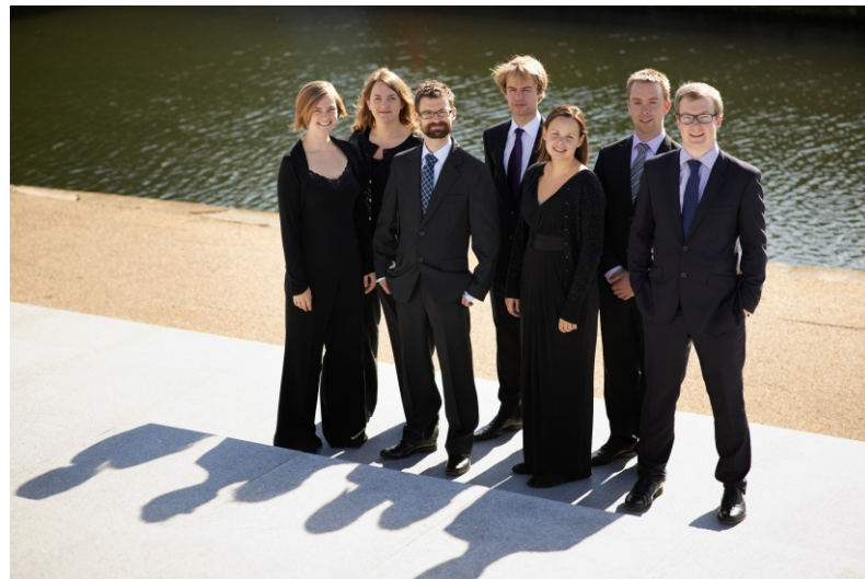
Berkeley Ensemble