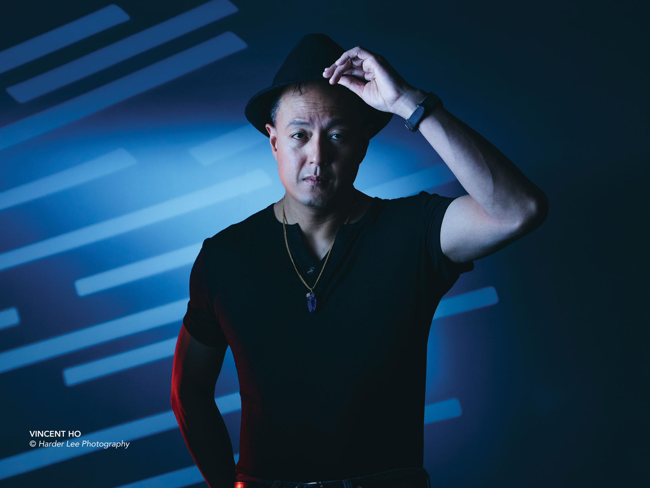
VINCENT HO