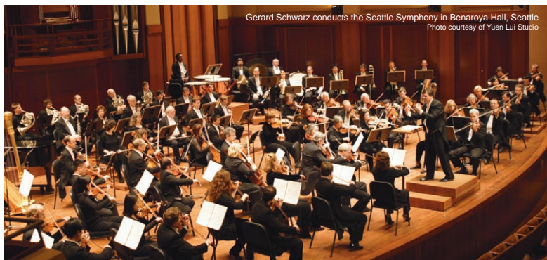
Gerard Schwarz conducts the Seattle Symphony in Benaroya Hall, Seattle

The Seattle Symphony, founded in 1903, has gained international prominence with more than 140 recordings, 12 GRAMMY® nominations, two Emmys and numerous other awards. Gerard Schwarz led the Orchestra from 1985 to 2011, and is now Conductor Laureate. The Seattle Symphony is internationally recognized for its innovative programming and extensive recording history. The orchestra performs in one of the world's finest concert venues – the acoustically superb Benaroya Hall – in downtown Seattle. Under the leadership of Music Director Ludovic Morlot since September 2011, the Symphony is heard live from September through July by more than 315,000 people. For more information on the Seattle Symphony, visit www.seattlesymphony.org .