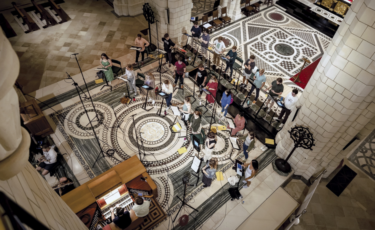
The Choir of Royal Holloway during a recording session